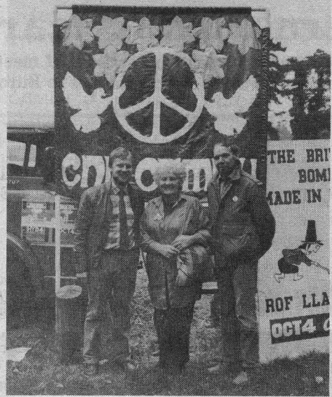
The three representatives who represented CND Cymru as delegates to European Conferences during October (see articles under International Year of Peace 1986 heading).

On November 21st the Wales NFZ Forum agreed to adopt a Common Format for Nuclear Free roadsigns for use in Wales. The design is based on the Peace Dove Symbol and will be available and hopefully, widely in use by Nuclear Free Wales week.